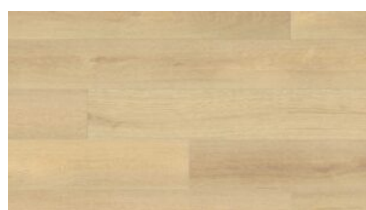
Blonde Montreux Oak