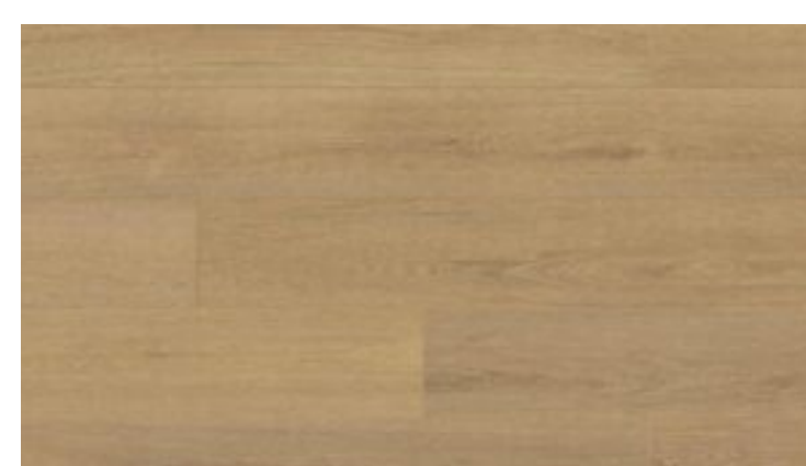
Natura Montreux Oak